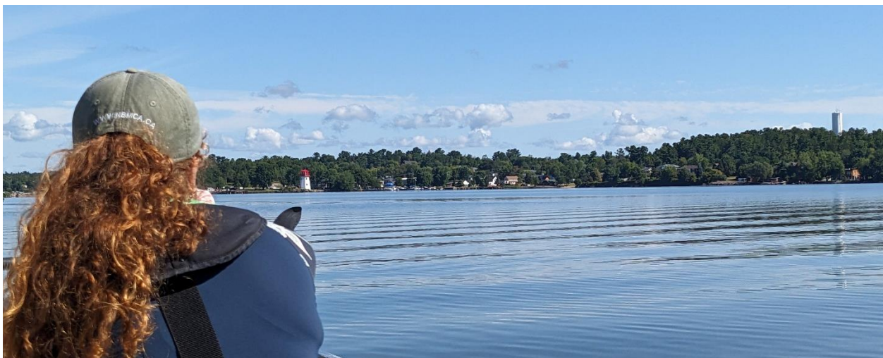
Figure 2: NBMCA staff returning to the dock after collecting water samples on Callander Bay for total phosphorus analysis

All eight municipalities have implemented all significant threat policies. However, the education and outreach approach used for the implementation of Policy SMF1, related to land application of source material and fertilizer (SMF) nutrients, does not technically meet the policy intent of prohibiting this activity. A full explanation is provided later in section IV.6.