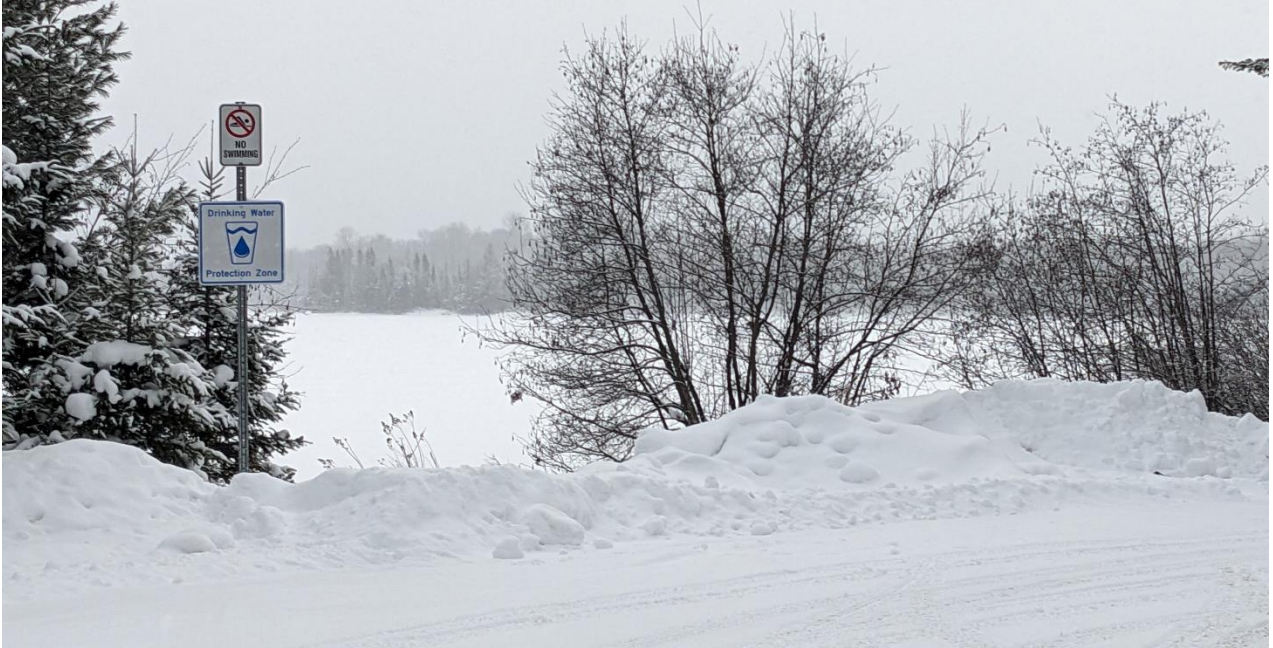
Figure 3: Municipal road signs marking intake protection zone and wellhead protection areas (South River Reservoir)