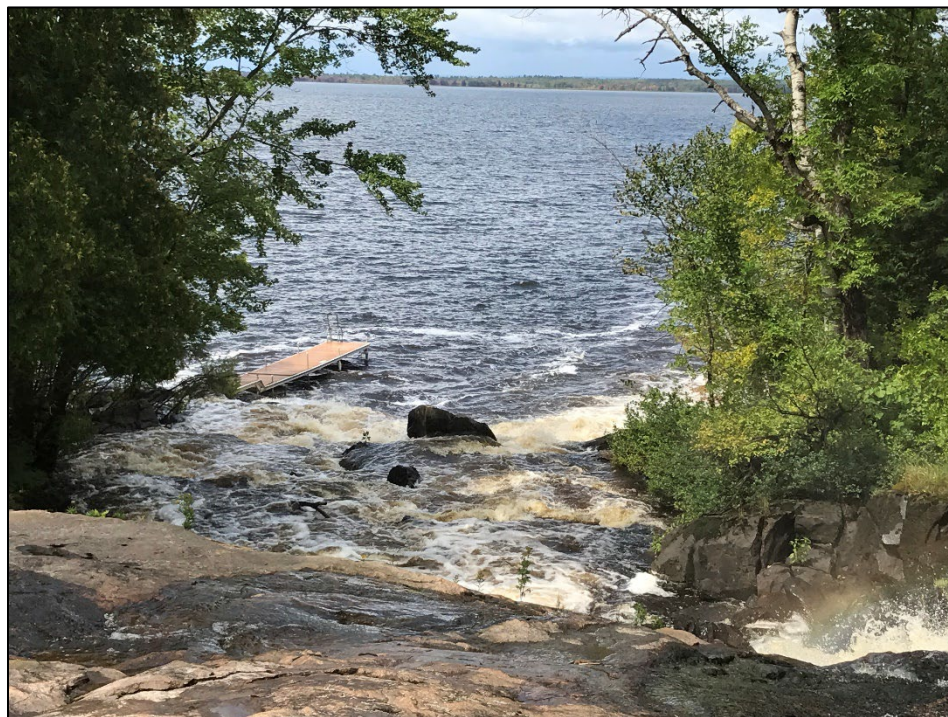
Above: The Wasi River empties into Callander Bay after a dramatic set of waterfalls.

The North Bay-Mattawa Source Protection Committee wishes to express their thanks to municipalities for the long-standing cooperation in Source Protection Plan implementation.